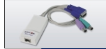
RIC PS/2 Cable (also available for SUN & USB)