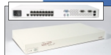
Smart 16 IP Switch