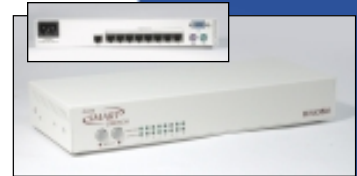
Smart CAT5 Switch, 8 Ports