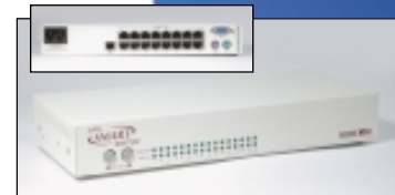
Smart CAT5 Switch, 16 Ports