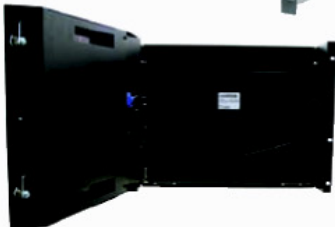
Monitor door open. Keyboard in upright stowed position.