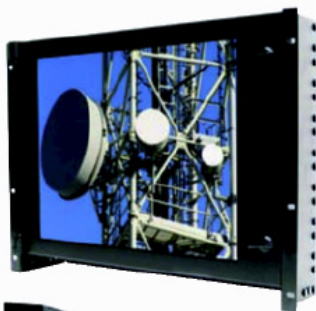
Fully closed. Functions as a rack mount monitor.