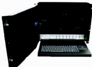
Monitor door open. Keyboard lowered for use. Allows access to rear mounted equipment.