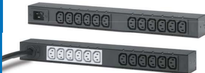
Horizontal 1U or Vertical Mounting